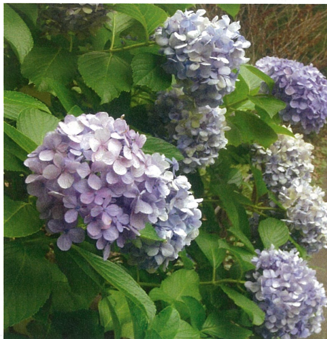
[hydrangeas in the Kitanomaru Park]

In June, we see the beautiful flowers native to Japan, hydrangeas, called AJISAI in Japanese language. The colors of the flowers varies from white, pale green, pale blue, purple and pink. Hydrangeas that bloom during the rainy season are special for Japanese people, so that a lot of events with Hydrangeas as the theme, are held in many places. Let's enjoy the rainy season when they are bursting into bloom.