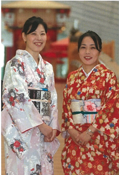
models: M and K

The world Kimono means “clothing”, and up until the mid 19 th century it was the form of dress worn by everyone in Japan. There are different types of Kimono for different occasions and different generations. Nowadays, people don't wear Kimono as often as they used to be while Western clothes are almost always worn for daily activities. Therefore, Kimono is generally worn for such occasions as special ceremonies (weddings/ graduations) and receptions. People also wear Kimono for traditional cultural activities like tea ceremony, incense ceremony and Ikebana flower arrangement.