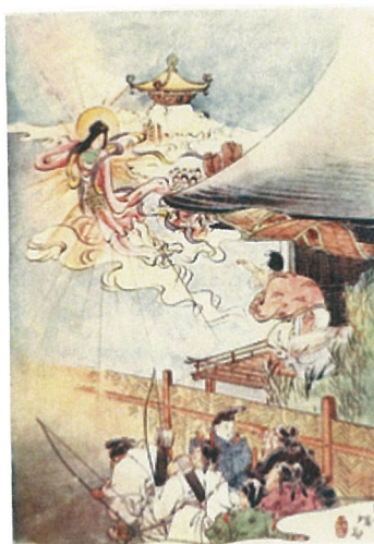
The receding Princess

Once upon a time, found inside a shining stalk of Bamboo by an old bamboo cutter and his wife, a tiny girl was taken back their home and was taken good care of. This good old couple just loved her very much as one of their family members. The tiny girl grew rapidly: in just three months she grew into an exquisite young lady. The mysterious young princess enthralls all who encounter her, but ultimately she must confront her fate, returning to the place where