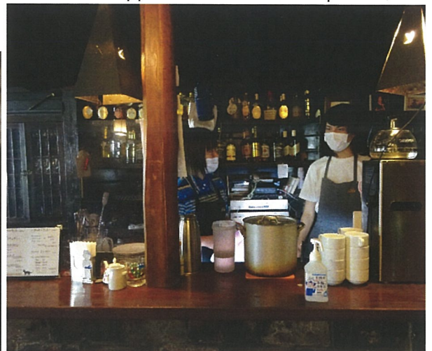
classical cafe [LADRIO] since 1949

LOCATION; 1-3 Kanda-Jimbocho Chiyoda-ku Tokyo TEL; 03-3295-4788