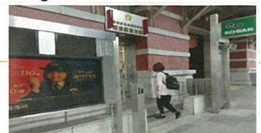
Marunouchi Police Box at Tokyo Station

Japan has a unique police system. Police boxes scattered throughout the community (over 1200 just in Tokyo) with police officers on duty. The Police box system was created at the beginning of the Meiji period in the 1870s. The Meiji government hired 3000 police officers to patrol the area around the central Police Station. Local Police Stations were built beginning in 1881 and completed nationwide by 1888. The police box system maintains community security as police officers respond to emergencies, do preliminary examinations at accident sites, help people find their way to local addresses, help people in distress (missing persons, runaways) and maintain lost & found items. They are integral to their neighborhood and help safeguard the comfort of life.