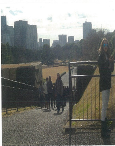
A view from top of the donjon base

The Imperial Palace with its grounds is located on the site of the former castle of the successive General Tokugawa in Edo Period.